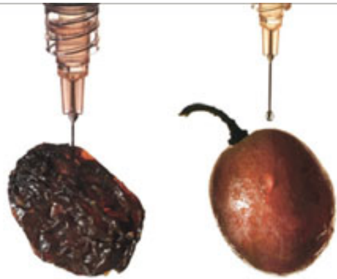
By Kevin Conley